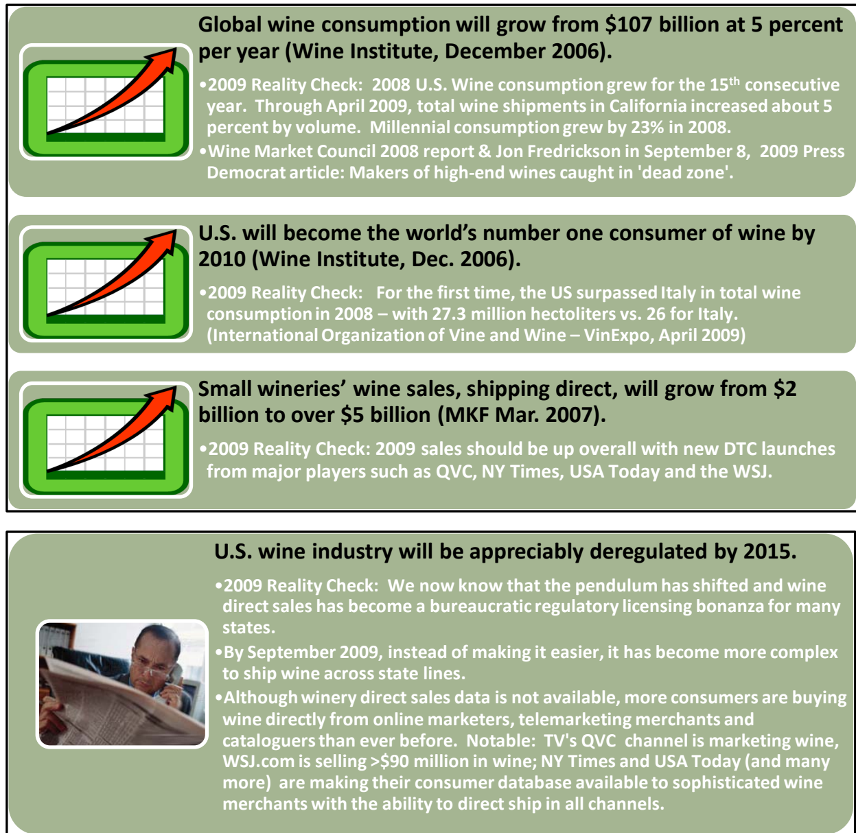
Figure 4 - 2009 Reality Check: Past 24 Months, Revisiting Six Predictions